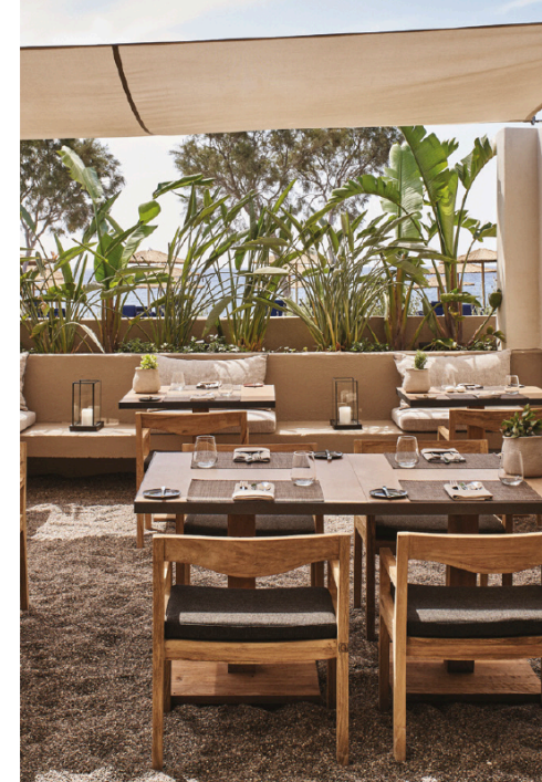
Istoria on Santorini